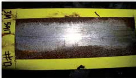
Zinc 500 Hour Salt Fog

The chart above displays the electrical activity of metals and known cathodic/anodic reactions resulting in the degradation of steel when in contact with copper, and conversely the degradation of zinc when in contact with steel.