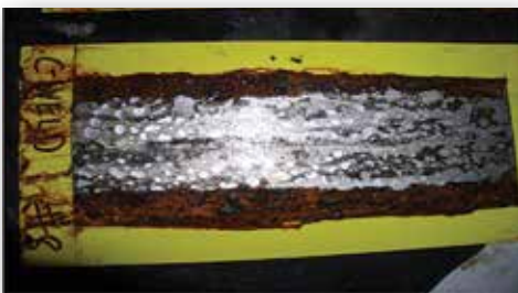
Copper 125 Hour Salt Fog