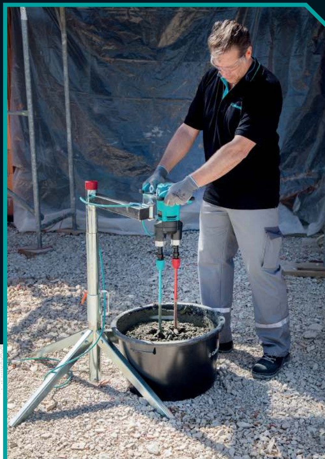
Xo 33 R duo