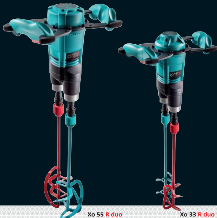
Xo 55 R duo