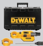
DWH050K LARGE HAMMER DUST EXTRACTION - HOLE CLEANING