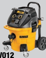
DWV012 10-GALLON HEPA/RRP WET/DRY DUST EXTRACTOR

*For 20V MAX* Maximum initial battery voltage (measured without a workload) is 20 volts. Nominal voltage is 18.