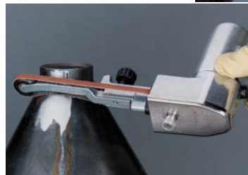
Optional 11200 Stroke Sander Arm leaves in-line scratch pattern.