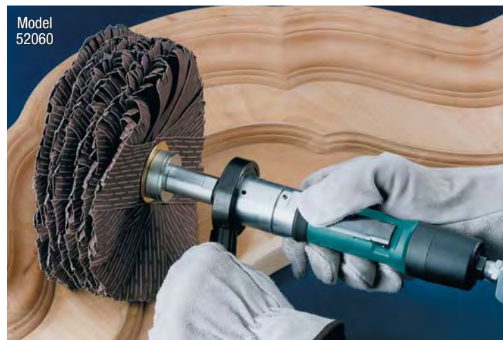
Sanding Stars are ideal for work on intricate profiles.

For best performance of all sanding stars, prior to application "dress" the abrasive tips against optional 52031 Stainless Steel Abrasive Dressing Plate or equivalent. Also, a piece of hardwood such as oak will do. Dressing will break the stiffness, or flex the abrasives, resulting in a more consistent finish.