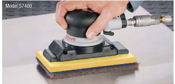
Dynaline achieves in-line scratch pattern on stainless steel by powering non-woven nylon abrasives on long nap hook-face pad.