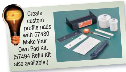
Create custom profile pads with 57480 Make Your Own Pad Kit. (57494 Refill Kit also available.)