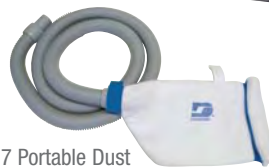
50617 Portable Dust Collection Systems (see page 156).