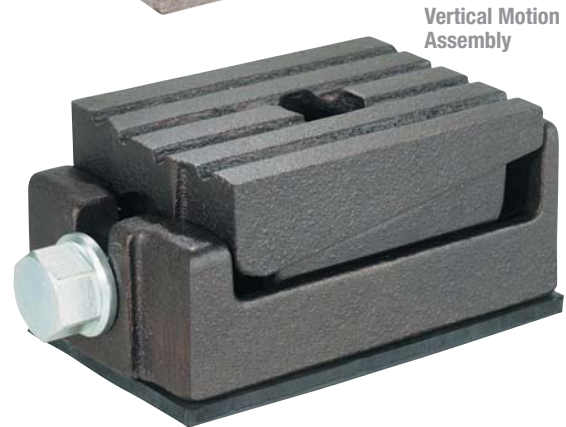
Vertical Motion Assembly