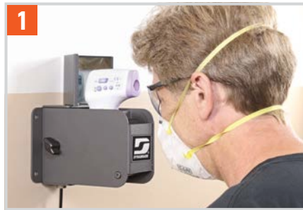
1 - Place forehead in front of thermometer