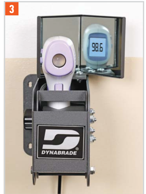
3 - View temperature number in mirror

This system is not intended to diagnose, prevent, or treat any disease or condition, and it is not intended for medical use. It measures skin temperature as a proxy for body temperature which is not 100% correlated. Specifications and undocumented specifications are subject to change without notice or liability.