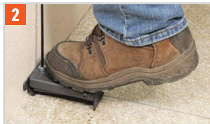
2 - Place foot on activation button