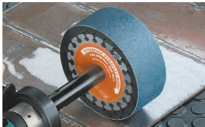
ADDITIONAL SPECIFICATIONS: Arbor Length = wheel width + 1/2"

NOTE: Speed of tool must not exceed maximum operating speed of accessory