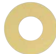
"O-Style" Abrasive Disc 5-1/2" Center Hole