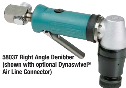
58037 Right Angle Denibber (shown with optional Dynaswivel® Air Line Connector)

See additional Tool Hangers on page 253!