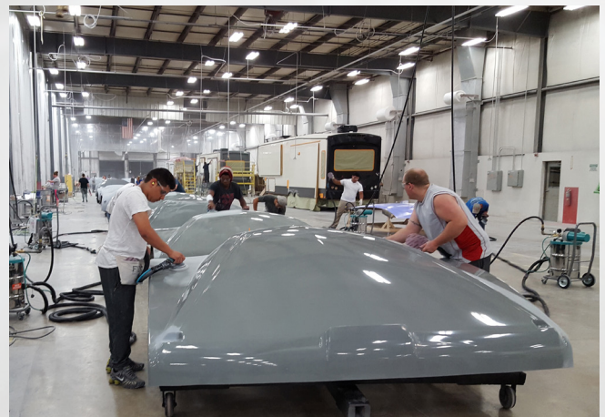
Dynabrade tools and vacuums contribute to the optimization of applications and environments.