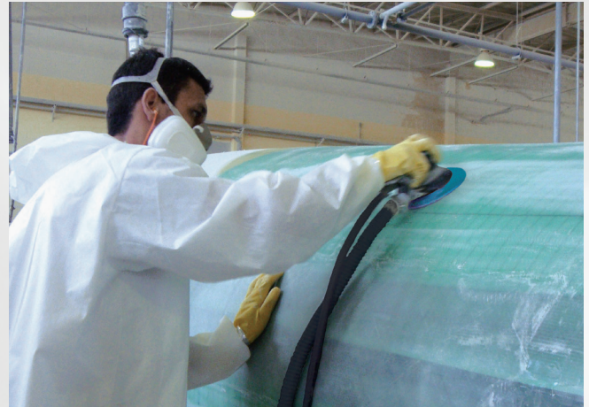
Sanding applications have a high likelihood of generating static electricity.