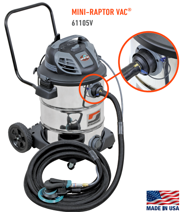
MINI-RAPTOR VAC ® 61105V

Additional Specifications Vacuum Port - 1" | Air Inlet - 1/4" NPT | Hose I.D. - 1/4" (6 mm) | ROS Pads have a 5/16"-24 Male Thread