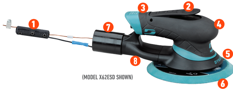
(MODEL X62ESD SHOWN)