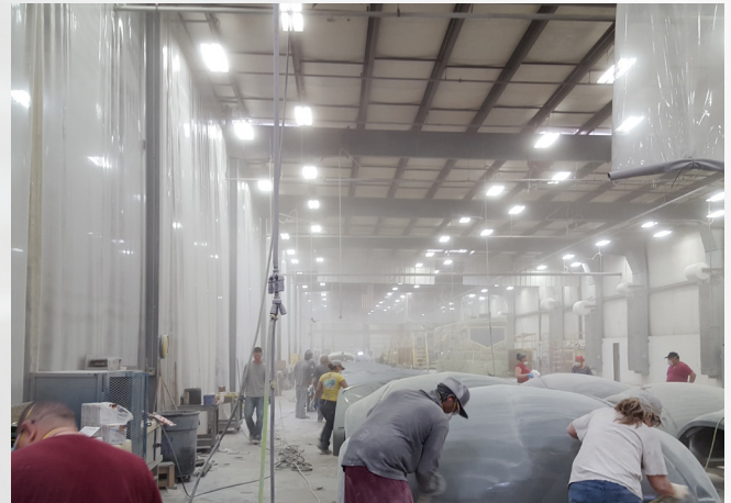
Dry, dusty areas or areas with certain vapors can compound ESD complications.