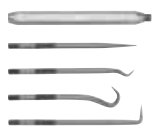
3121D 5 Pc. Set Only available as a set