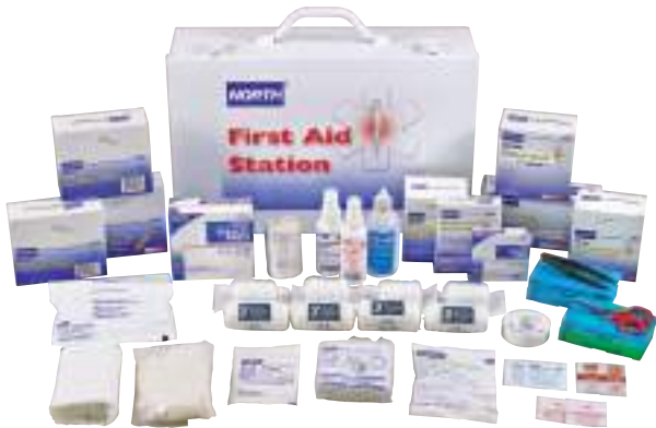
019720-0009L FIRST AID STATION