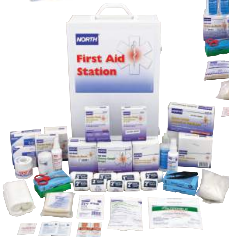
019721-0010L FIRST AID STATION