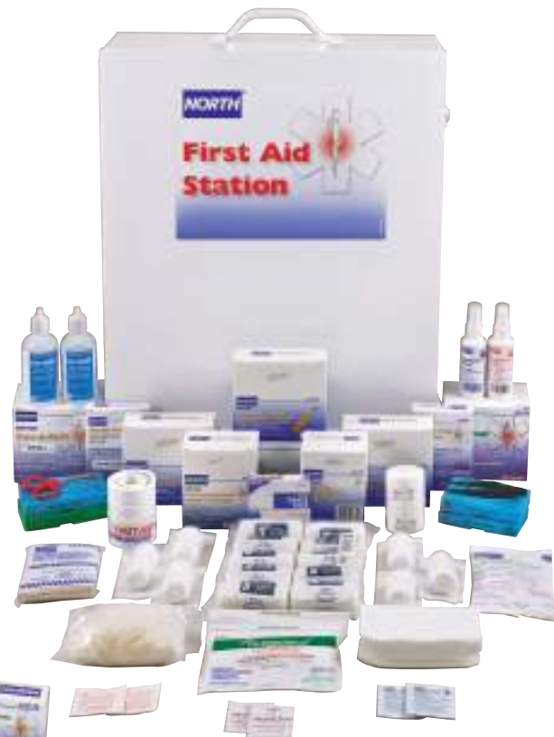
019722-0011L FIRST AID STATION