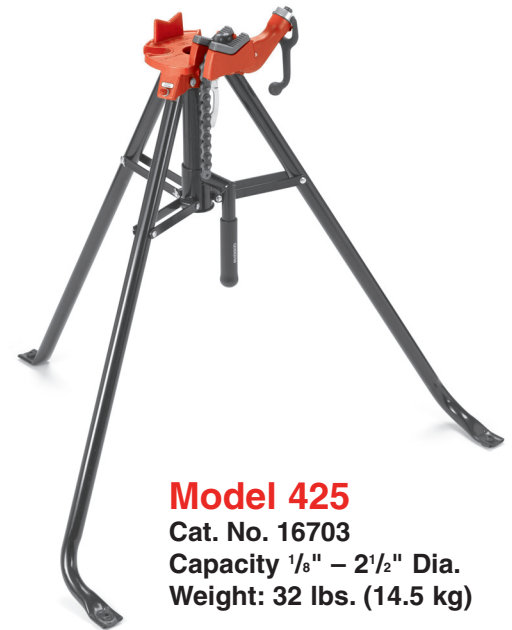
Model 425 Cat. No. 16703 Capacity 1/8" – 2 1/2" Dia. Weight: 32 lbs. (14.5 kg)