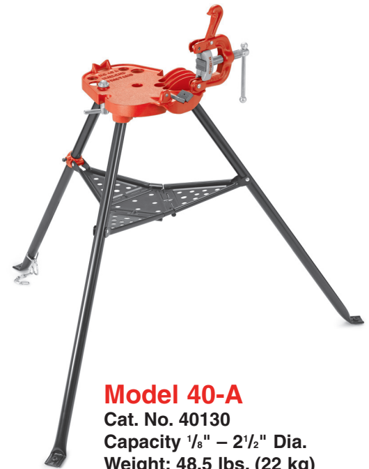
Model 40-A Cat. No. 40130 Capacity 1/8" – 2 1/2" Dia. Weight: 48.5 lbs. (22 kg)