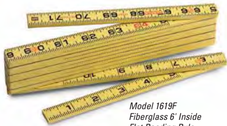
Model 1619F Fiberglass 6' Inside Flat Reading Rule