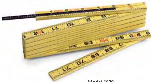
Model 1620 Fiberglass 6' Extension Rule with 6" Extension Slide