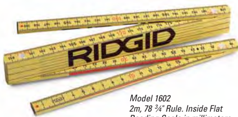
Model 1602 2m, 78 3/4" Rule. Inside Flat Reading Scale in millimeters. Outside Scale in inches