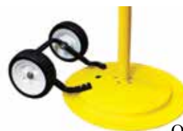
OPTIONAL WHEEL KIT