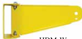
HDM-W WALL MOUNT

Note: 1 1/2" pipe piece required for assembly