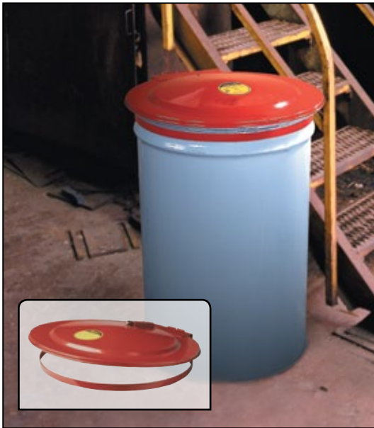
High-visibility red finish provides increased awareness in the workplace.