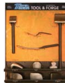
Sample Board with Header