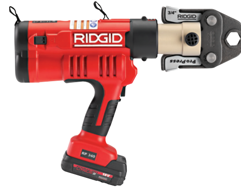
RP 340 Battery Tool with ProPress® Jaws