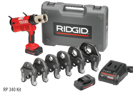
RP 340 Kit