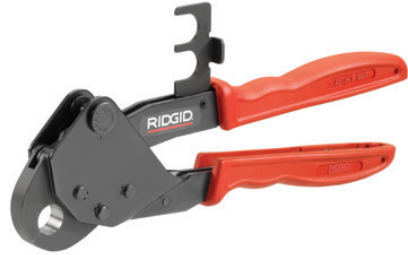
½" & ¾" Close Quarters PEX Crimp Tool