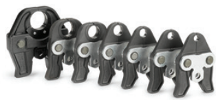
Standard Jaws for Pureflow™