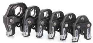
Standard Series Jaws for ProPress® Copper and Stainless