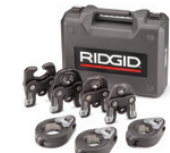
MegaPress® Jaws & Rings