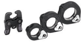
XL-C Pressing Rings for 2 1/2" to 4"