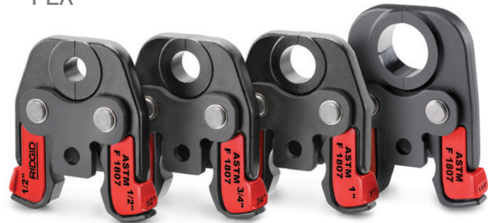
Compact Series ASTM F 1807 Jaw Sets for PEX