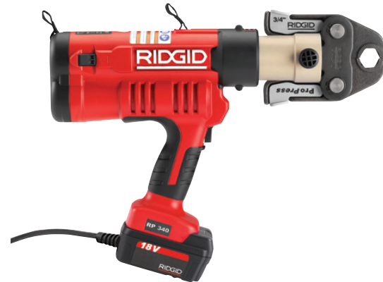
RP 340 Corded Tool with ProPress® Jaws