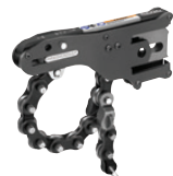
Press Snap™ Soil Pipe Cutter