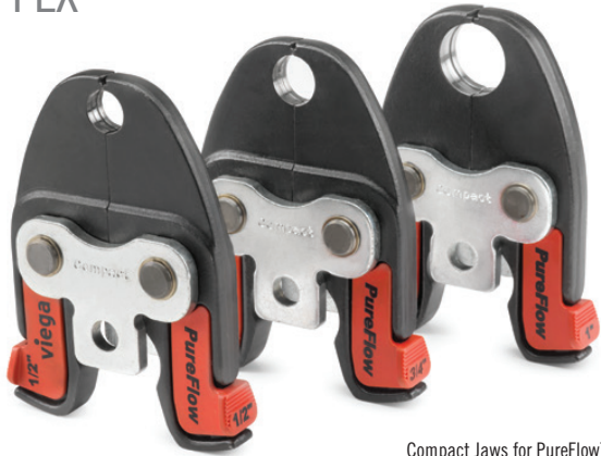
Compact Jaws for PureFlow™