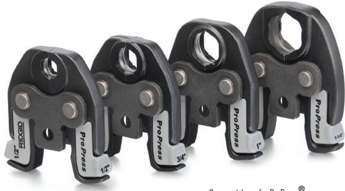
Compact Jaws for ProPress®