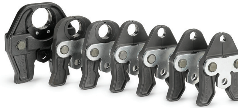
Standard Jaws for Pureflow™