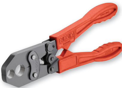
½" & ¾" PEX Combo Tool