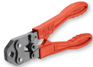
ASTM F1807 PEX Crimp Tool