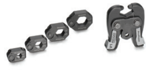
ProPress® Pressing Rings for 1/2" to 1 1/4"