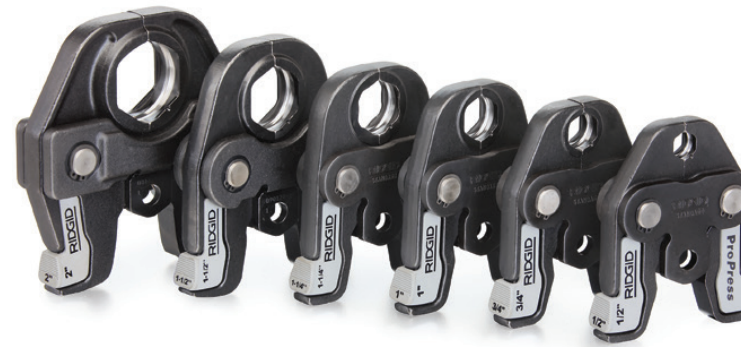
Standard Jaws for ProPress®