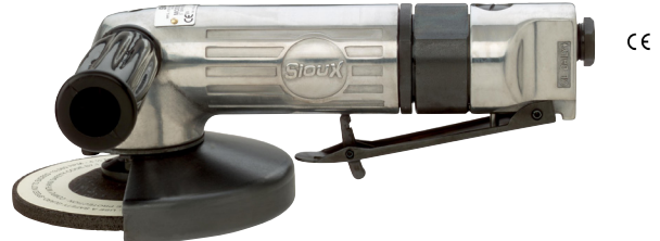
5" (127 mm) Right Angle Heavy Duty Grinder