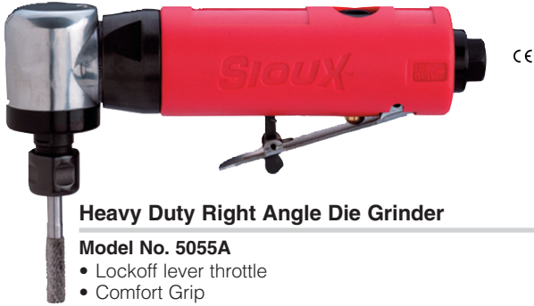
Heavy Duty Right Angle Die Grinder