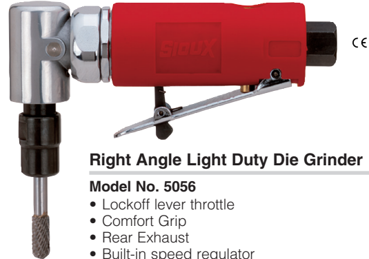
Right Angle Light Duty Die Grinder