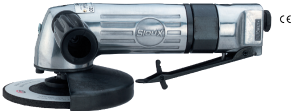
4 1/2" (115 mm) Right Angle Heavy Duty Grinder