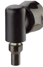
300 Series Collet