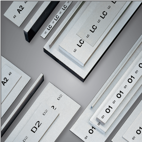
Flat Stock is identified by grade over its entire length to be easily identified even after it is cut off.