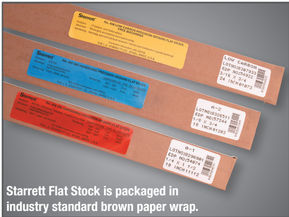
Starrett Flat Stock is packaged in industry standard brown paper wrap.