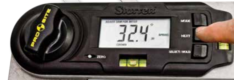
Setting a miter cut.